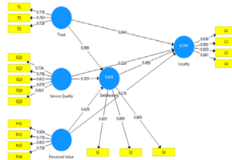
Figure 1: Outer Model.

The measurement model aims to test the accuracy of the relationship between indicators in a variable in measuring the latent variables. Testing of the measurement model consists of: convergent testing and discriminant validity, as well as composite reliability testing.