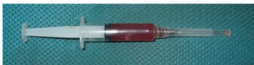
Fig. 3. Joint Aspiration with Yellowish, Serohemorrhagic Fluid.