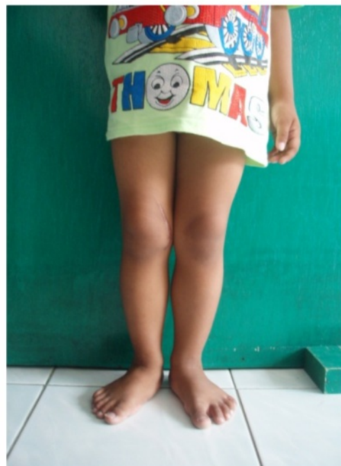
Fig. 5. Clinical Feature (5 Months Post Surgery). There is no swelling and normal range of movement of right knee joint.

Salmonella septic arthritis is more likely occur in patients with preexisting disease such as hemoglobinopathy especially sickle