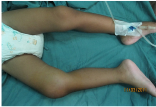
Fig. 1. Clinical Feature of the Right Knee Joint. There is significant swelling on the right knee with flexion deformity and restricted movement.

had typhoid fever and treated the child accordingly. After one week of treatment, the fever subsided.