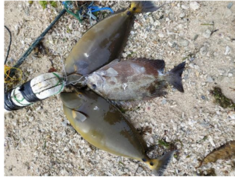
Picture.4. Caught fishes on multi-hook

place to put caught fish temporarily before being pulled to the beach.