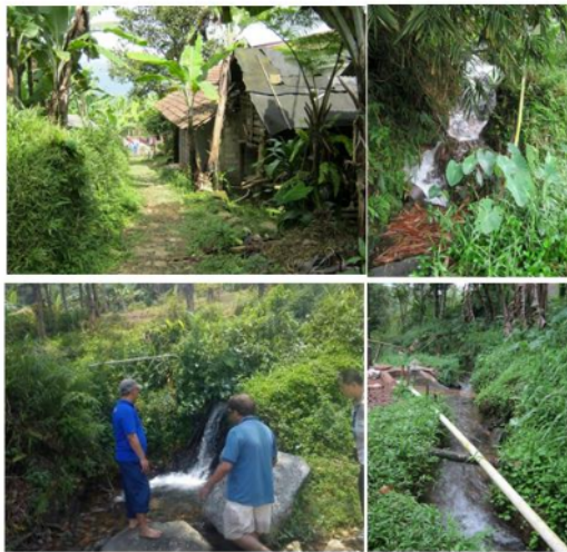
Figure.1 An overview of situation site of Picung River

Picung Village is located in Pamijahan Districts, Bogor, Indonesia. The river flowing through this village has its source from Seribu, Ngumpet, Cadas Ngampar, Cihurang, Nangka and Luhur Waterfalls as shown in Figure 1.