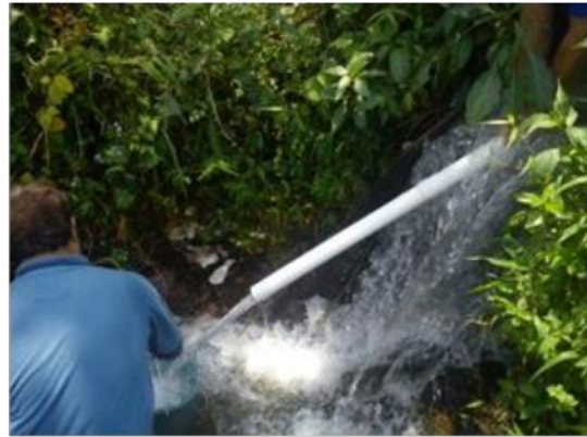
Figure 2. A flow of river

By measure the flow rate across the river using bucket as shown in Figure 2 we get the approximate measurement of 2m 3 /second, with this flow we will convert the potential energy from water to electricity [5]