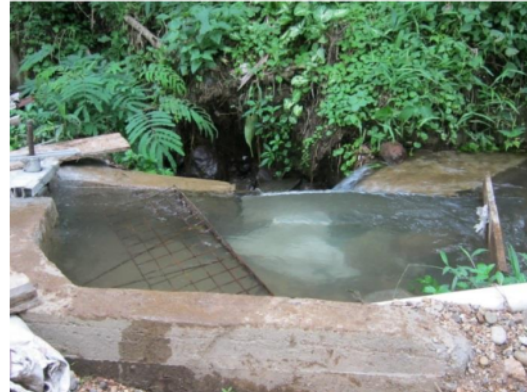
Figure 5. Dams built in the river

This is when water discharge is too small. The light on the stabilizer will turn yellow, so it is necessary to manually increase the water flow using the water control door.