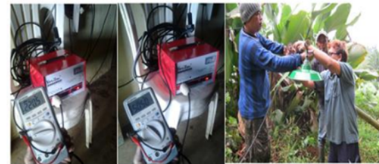
Figure 6. Electricity Output

In the implementation of this generator system, from the head observation, we calculated the potential power to be 8.4 kW. This system was coupled with 3kW generator and achieved a generated electricity power of 2kW only. This output we measure as shown in Figure 6.