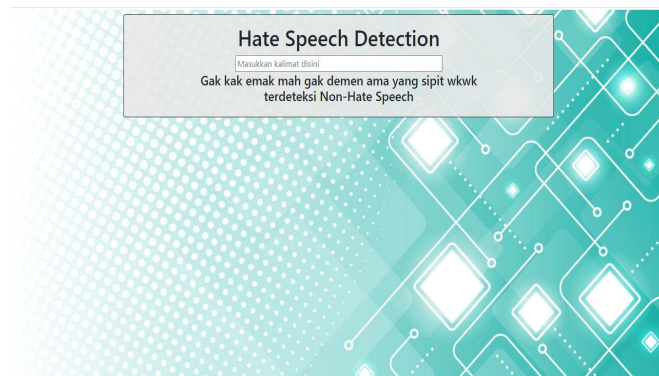
Fig. 3. Webpage preview of hate-speech detection